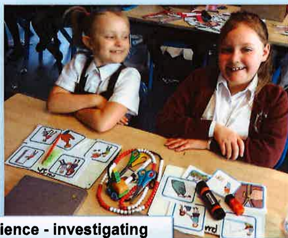
Science - investigating push and pull forces